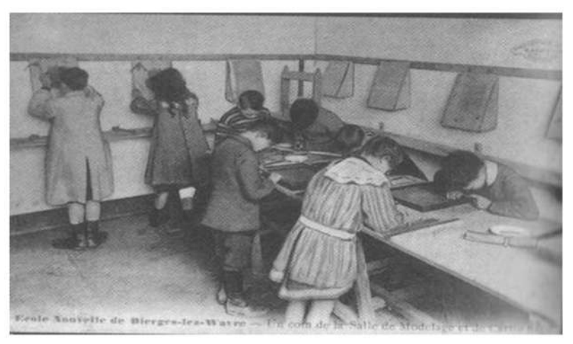
Figure 2. Working in the modeling room – School of Bièrges, 1913.