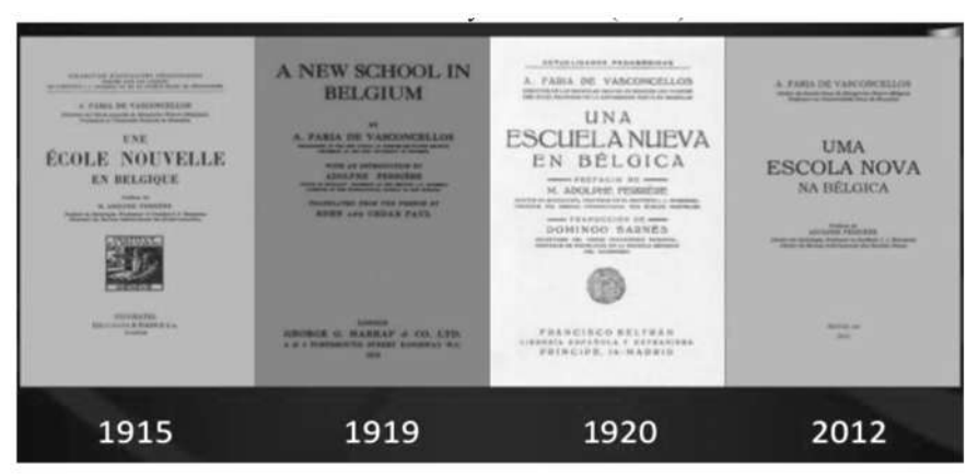
Figure 1. Some publications of Une École Nouvelle en Bélgique Sources: National Library of Lisbon (1915)

sels where he will do his doctorate and, in 1903, edited a small book of psychological and social content, entitled La Psychologie des Foules Infantiles the fruit of a university study. A year later he completed his doctorate in Social Sciences, with the thesis Esquisse d'une Theorie de la sensibilité sociale, which was awarded the rare classification of 'La plus grande distinction'. He exerts teaching positions as Professor of Psychology and Pedagogy at that University, in addition to teaching 'Dramatic Literature' at the University Extension of Belgium.