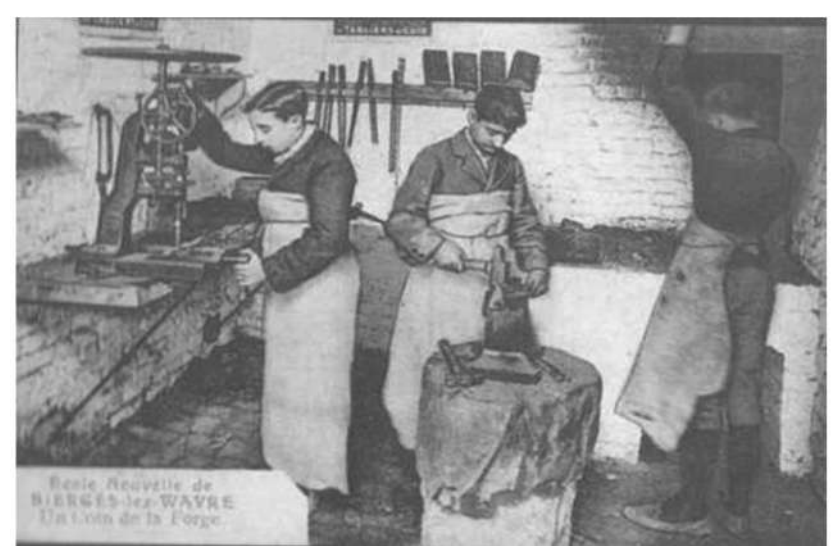
Figure 3. Working the iron in the forge – School of Biérges, 1913.