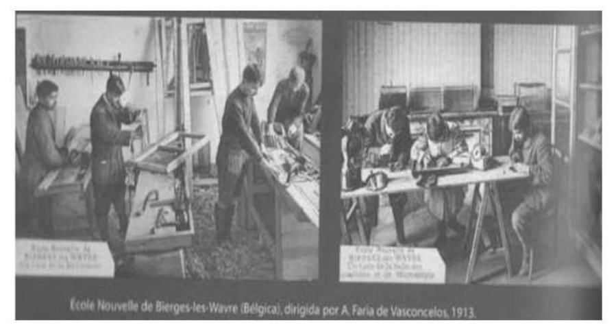
Figure 4. Working in the carpentry and in laboratory – School of Biérges, 1913.

ing useful knowledge from natural and participant observations and induction (theory followed practice) by placing them in contact with the" [...] forms of life and human labor" (Vasconcelos, 1915, p.102).